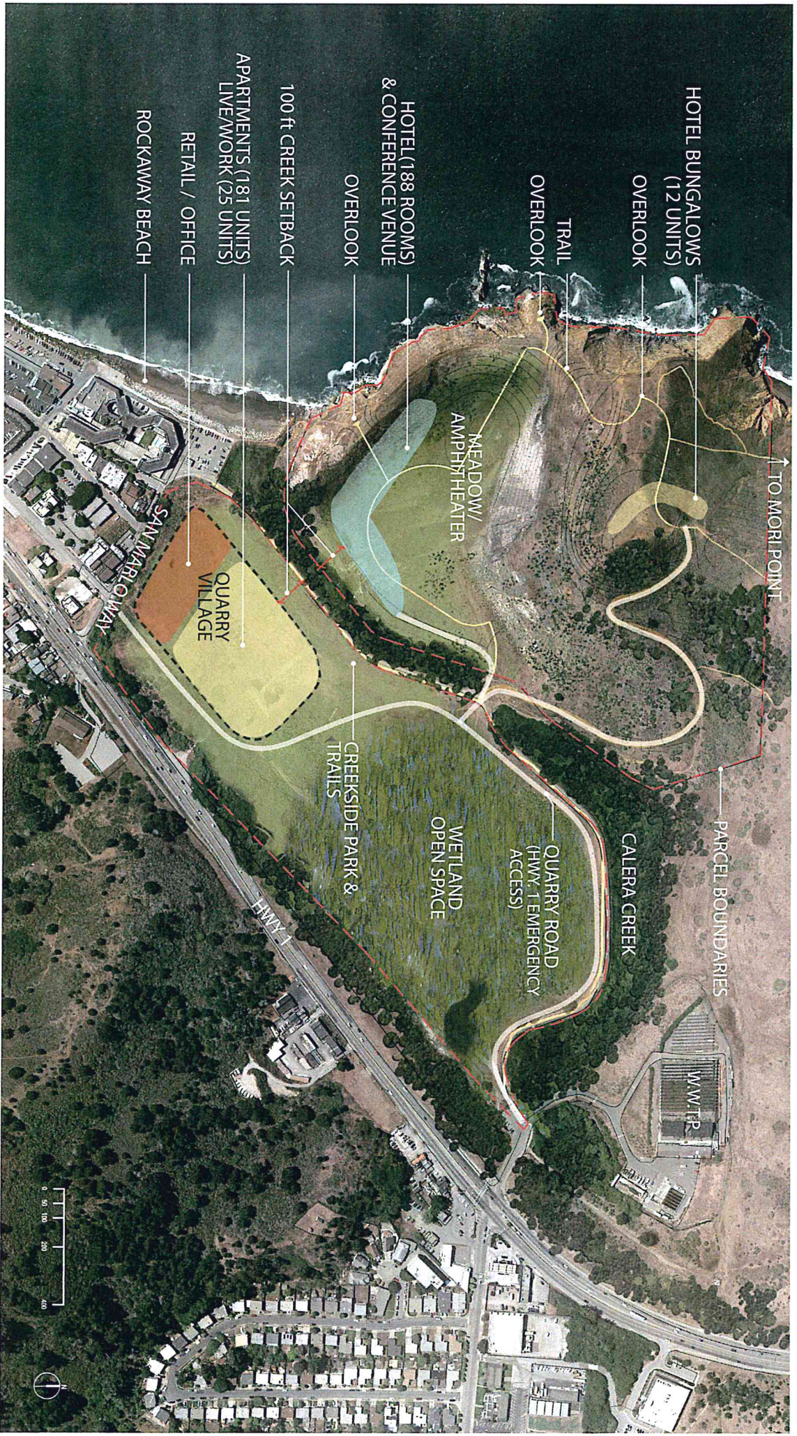
Exhibit A - The Pacifica Quarry Restoration and Responsible Development Initiative